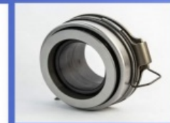
Clutch Release Bearing