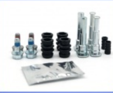
Brake Repair Kit