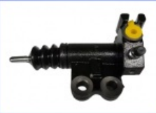
Brake Slave Cylinder