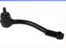
Tie Rod End