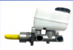
Brake Master Cylinder