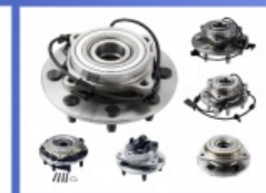
Wheel Hub Bearing