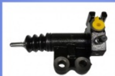
Brake Slave Cylinder