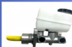
Brake Master Cylinder