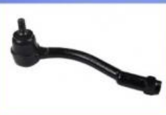
Tie Rod End