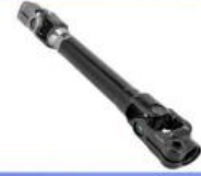
Steering Column Shaft