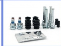
Brake Repair Kit