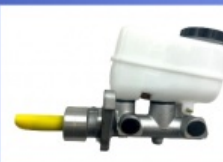
Brake Master Cylinder