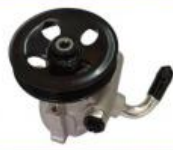
Power Steering Pump