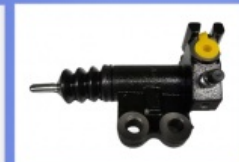
Brake Slave Cylinder