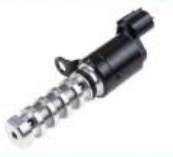
Oil Control Valve