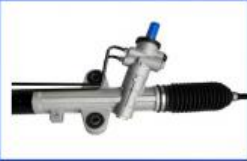
Power Steering Rack