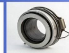
Clutch Release Bearing