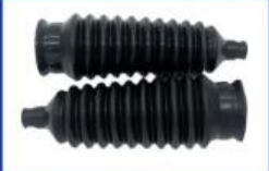
Steering Gear Boots