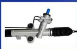
Power Steering Rack