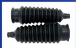
Steering Gear Boots