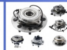
Wheel Hub Bearing