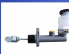
Clutch Master Cylinder